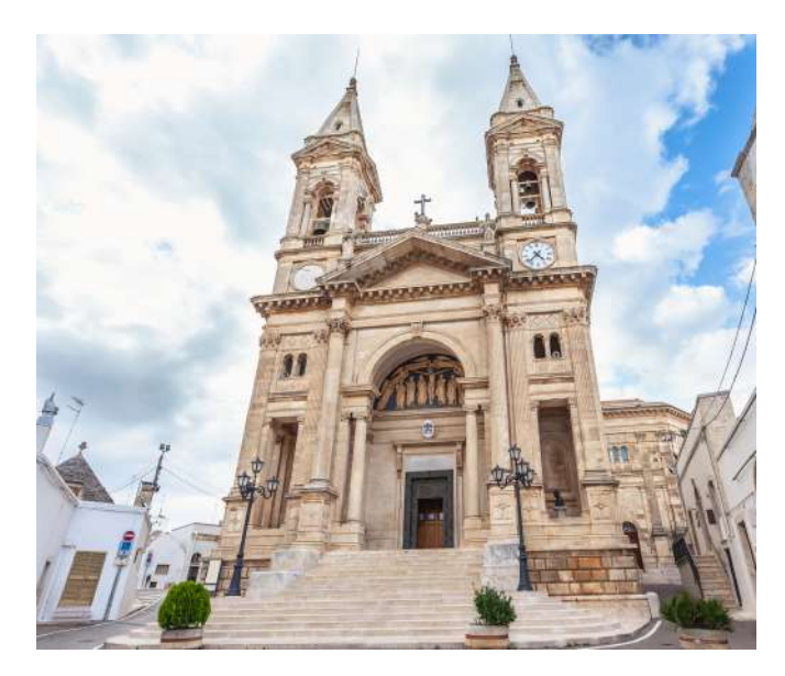
Day 3: Guided tour of Matera

Breakfast at the hotel, meeting with the guide and transfer to Matera for a walking tour of the city center. Matera is renowned for its Sassi , ancient cave dwellings carved into the limestone, which have been inhabited since the Paleolithic period and are today designated as a UNESCO World Heritage site .